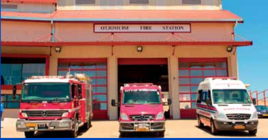
The newly commissioned Otjomuise Fire Station.

Once again, we would like to appeal to our residents especially in the informal settlement to refrain from invading land; this illegal act continues to pose direct negative implications which hamper proper planning and development of the City. The City understands the major need for